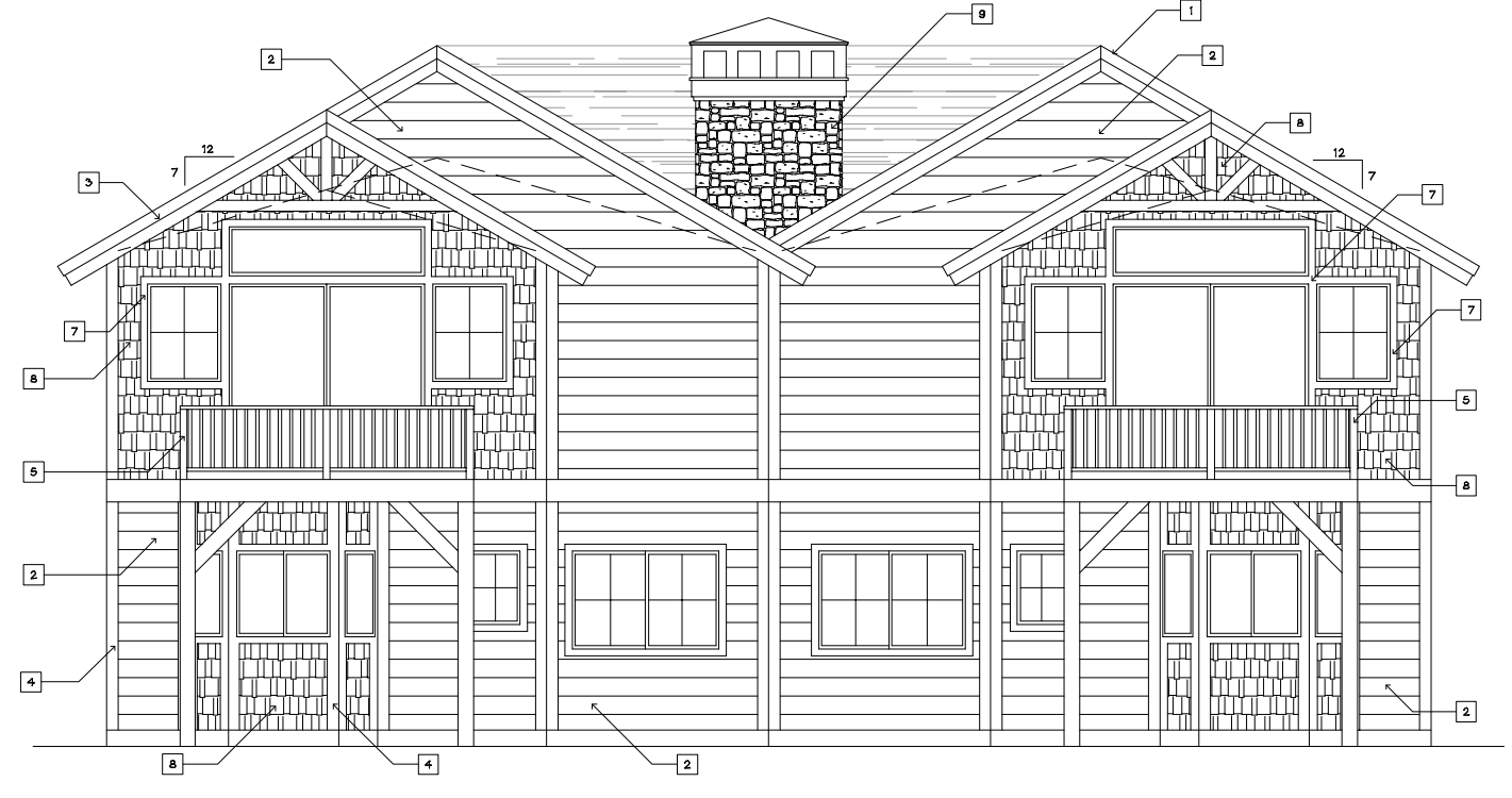
NORTH ELEVATION SCALE: 1/4" = 1'-0"

NOTE: REFER TO SHEETS A5.0-A5.13 FOR HEIGHT CALCULATIONS